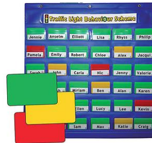
Y2 and Y3 use the Traffic Light chart