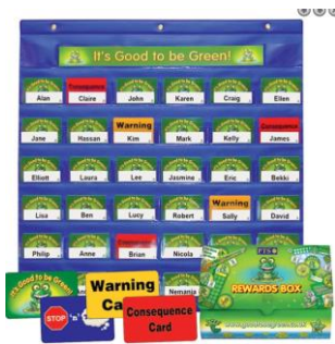
EYFS & Y1 use the Good to be Green chart.

Every classroom will have a behaviour chart displayed in the classroom.